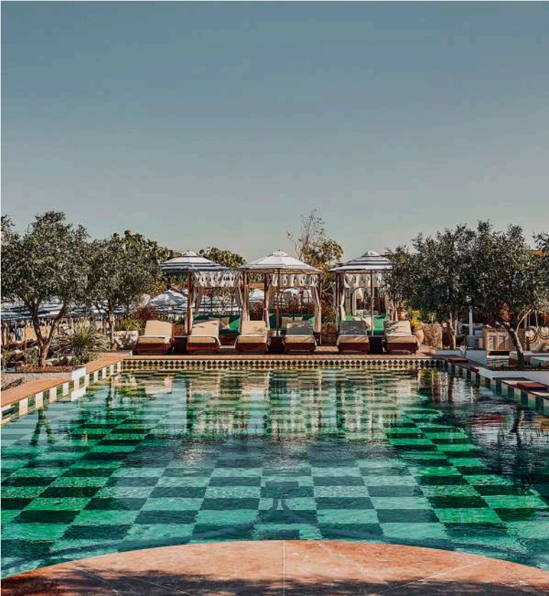
Framed by lush landscapes and designed for indulgence with a signature drink in hand.