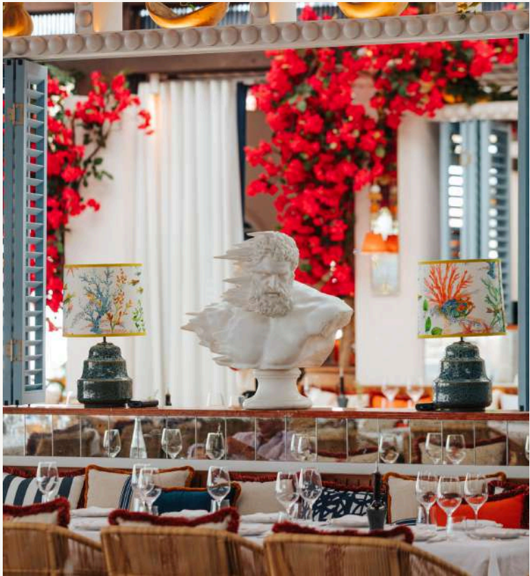
The Main Dining area invites guests into a world of culinary exploration in Greek tradition, where the concept of shared dining takes center stage.