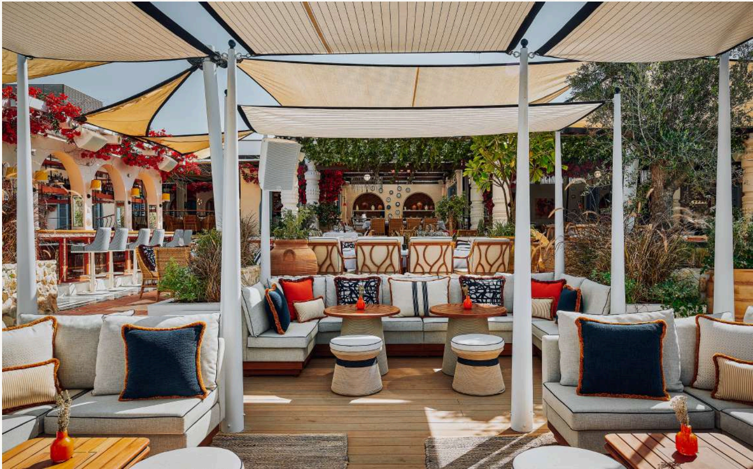
With stunning sea views, and a live music performance, it is the perfect spot to gather and socialize.