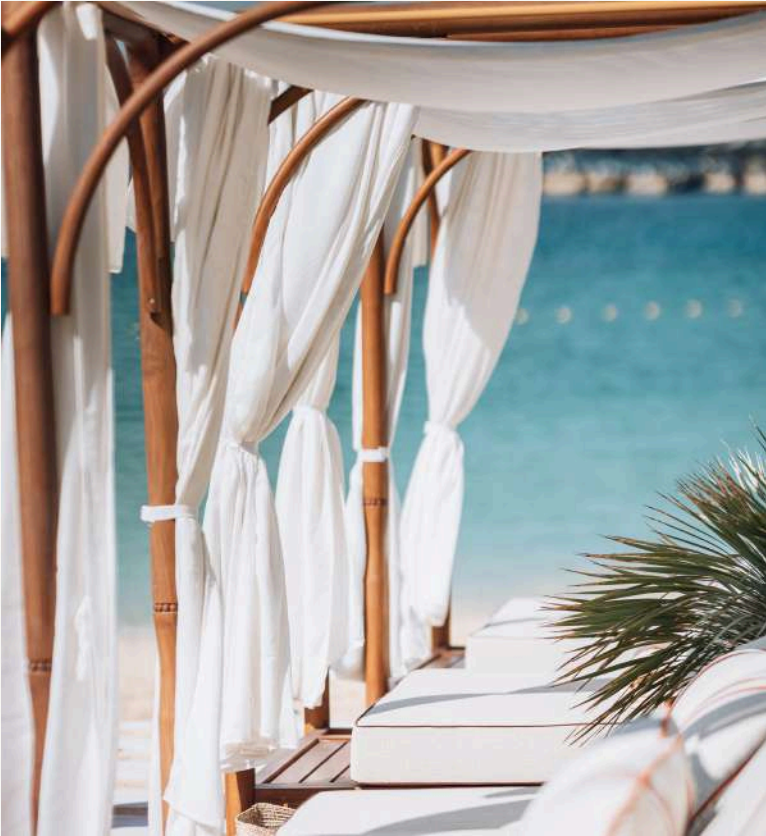
The Beach at Sirene is a tranquil sanctuary infused with Mediterranean allure.