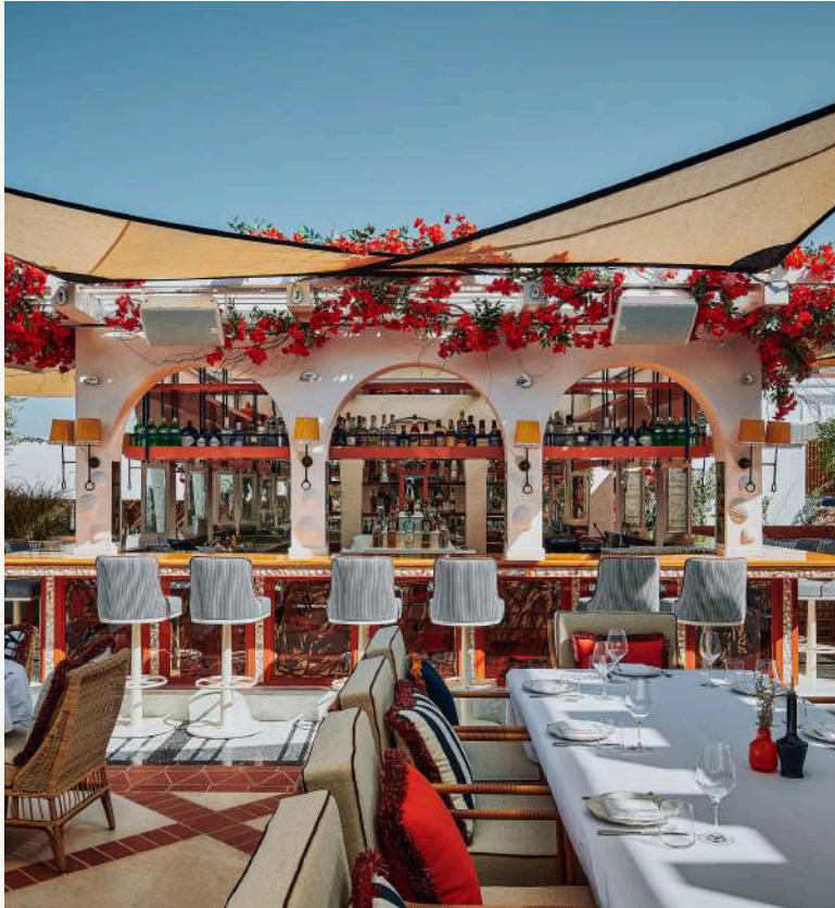
Restaurant Terrace is an exclusive space located at the heart of Sirene.