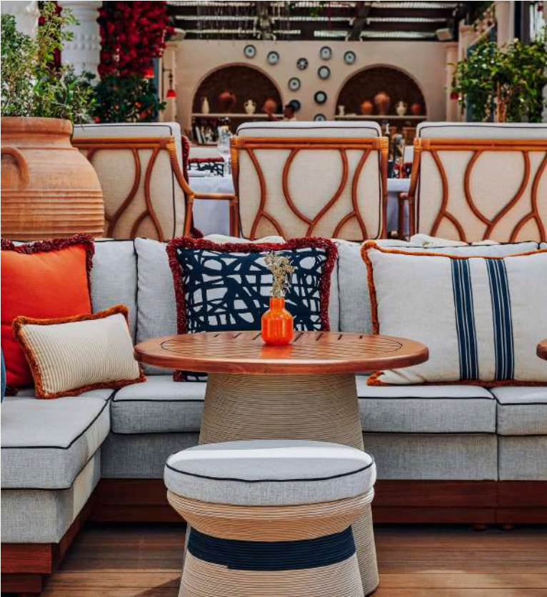
Situated next to the DJ stage, Sunset Lounge offers a sophisticated cocktail reception and a dance floor, steps away from the beach.