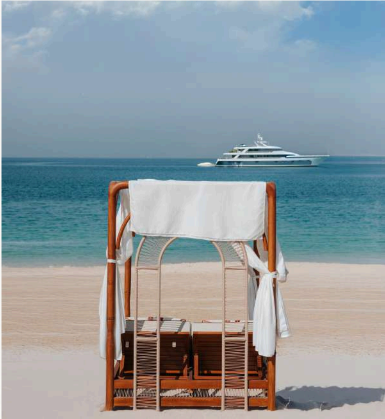
Soft sands, crystal-clear waters, and the gentle sound of waves complement the moments of connection with nature.