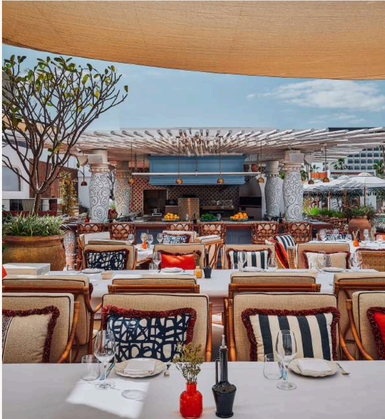
Positioned directly in front of the DJ, this premium setting allows guests to enjoy an exceptional dining experience while immersing in the vibrant energy of the music.