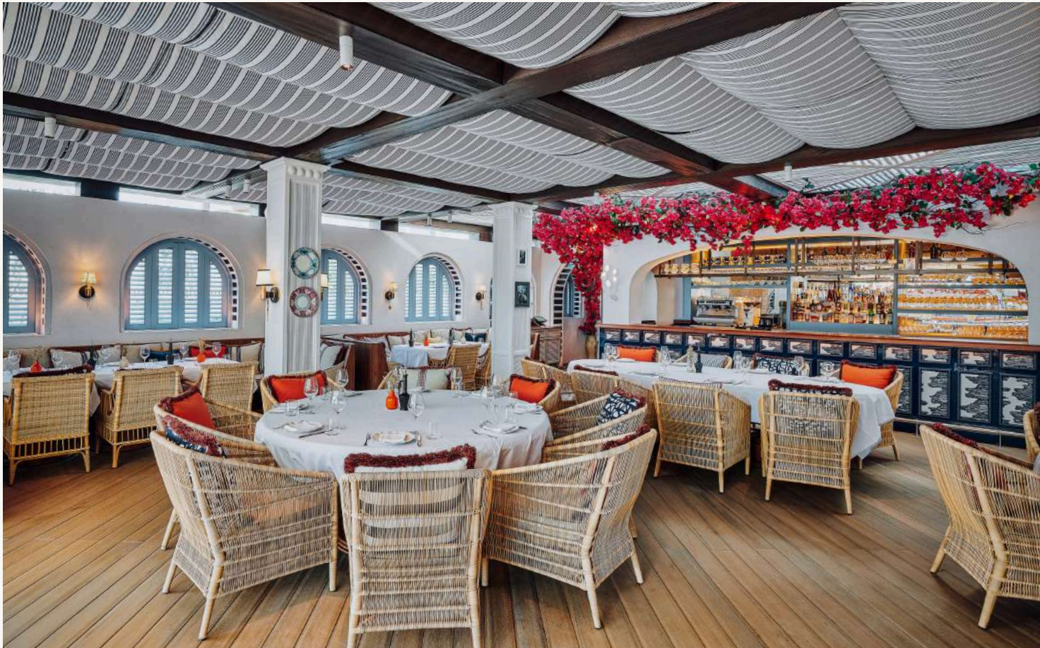
Above the main dining, the area features a private bar and an elevated balcony view, with the option to shover the curtains for added privacy.