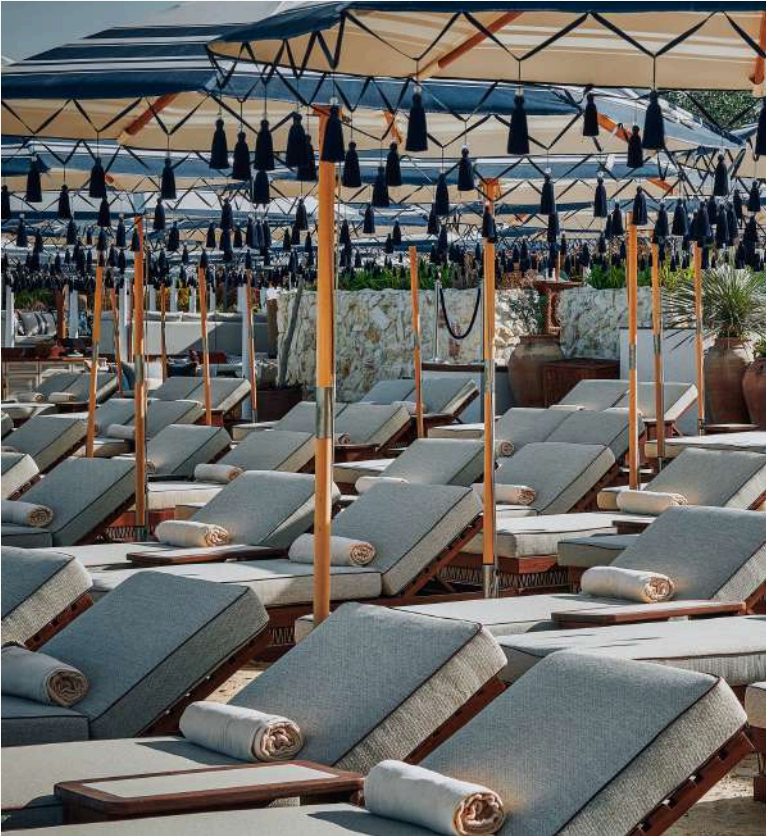
Where sun-kissed sands, tranquil waters and flowing drinks set the pace for unhurried moments.