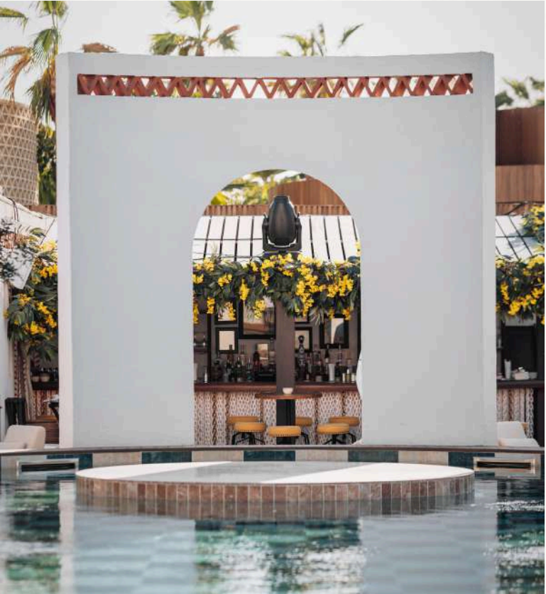
Its sleek design complements the tranquil atmosphere, making it a haven for both connection and rejuvenation.