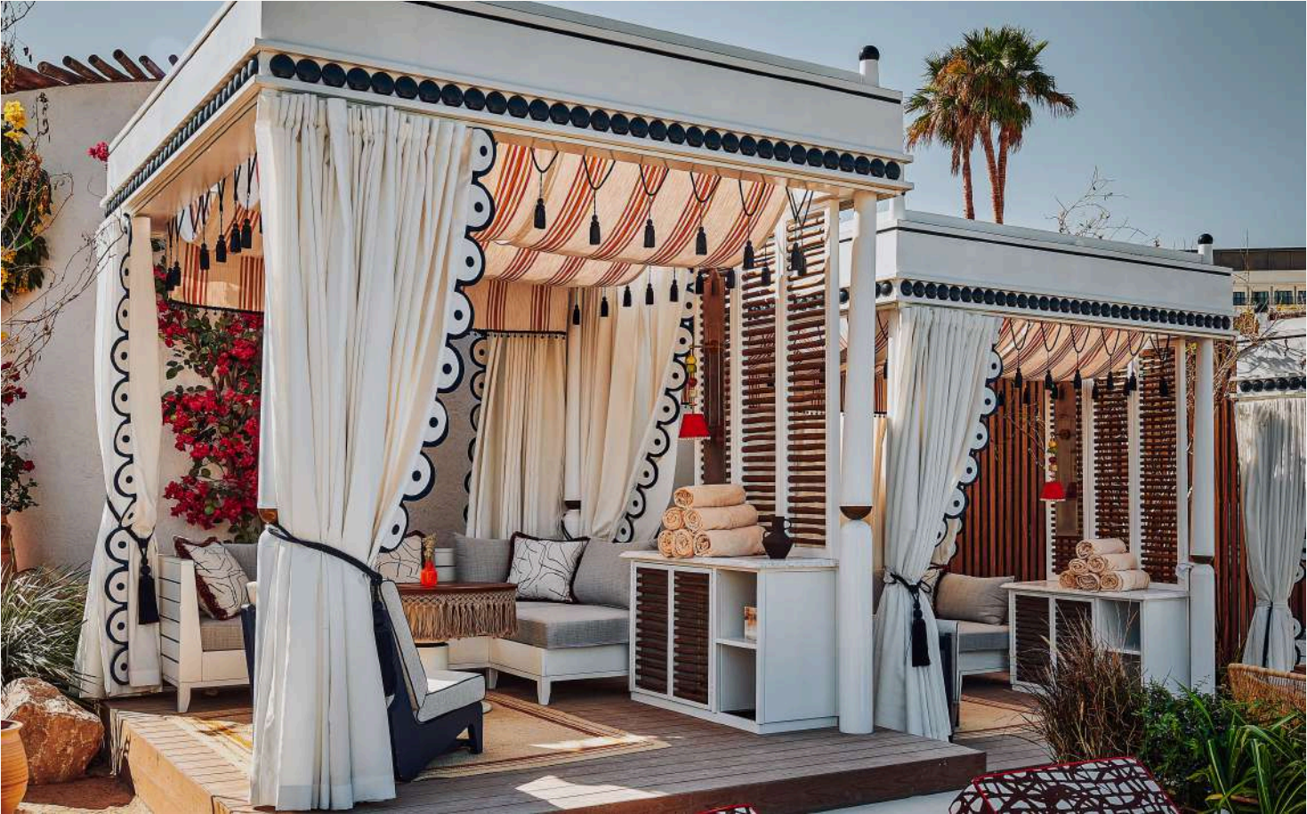
Designed for those who seek both exclusivity and connection with dedicated service catering to every need—whether it is handcrafted cocktails, gourmet bites, or a perfectly chilled bottle of champagne.