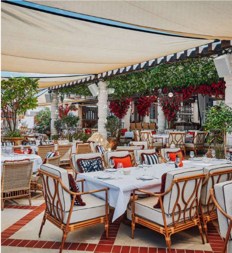
Offering panoramic views of the scene, this space effortlessly blends high-end dining with the electric vibe of a dance floor.