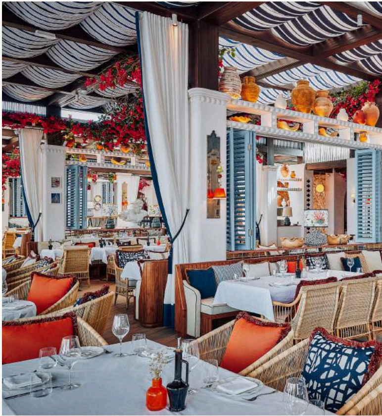
A seamless blend of modern aesthetics and core elements of Grecian culture invites guests to experience elevated culinary offerings.