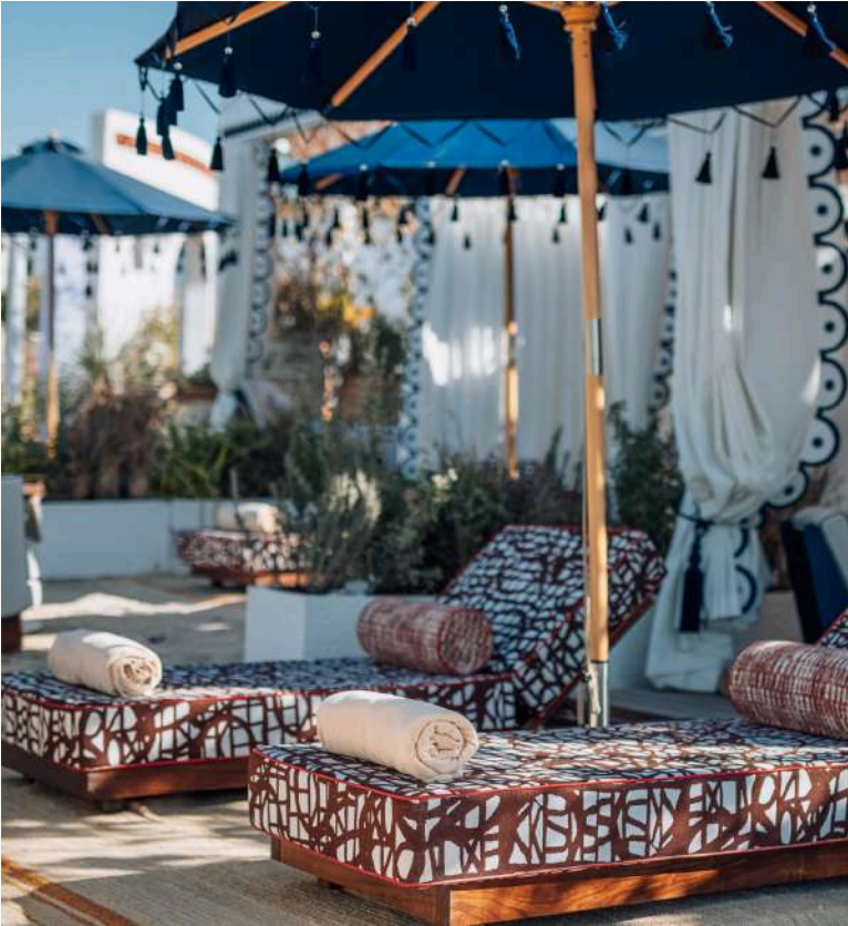
Tucked away for privacy yet immersed in the atmosphere, the Private Cabanas offer a secluded retreat with uninterrupted views of the beach.