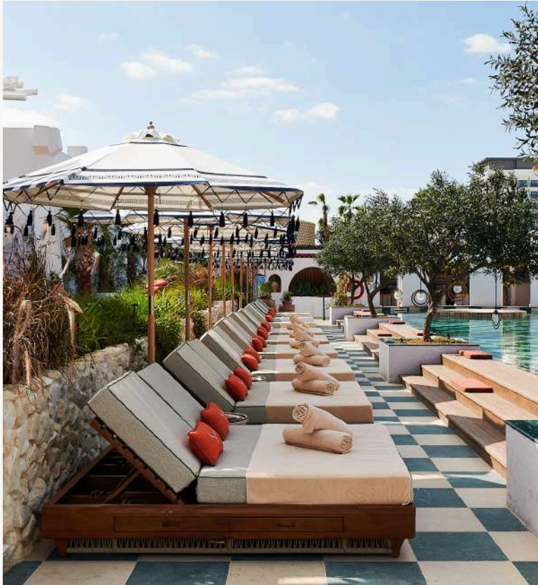
Designed for relaxation, The Pool area offers a calm spot under the sun to unwind and take a refreshing swim.