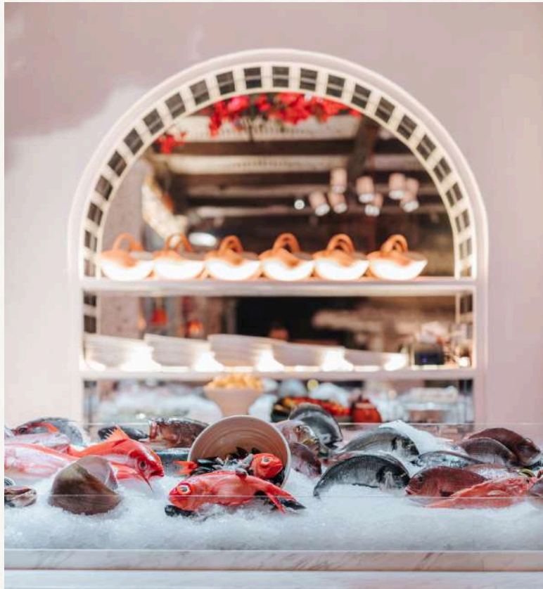
The Fish Market offers a unique experience where guests can engage with the fisherman, handpicking the freshest seafood to be cooked to preferences.